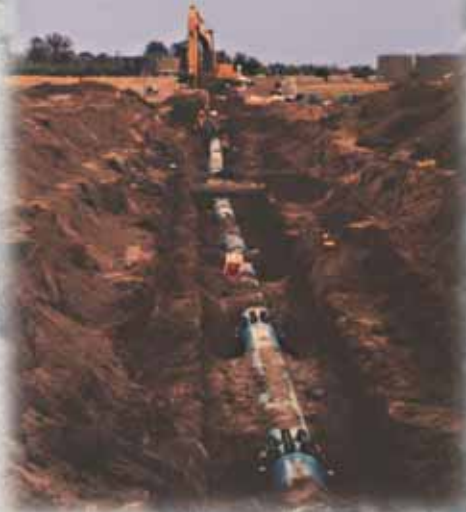
Series 1390 Bell Joint Restraints being installed in a "stepped trench."