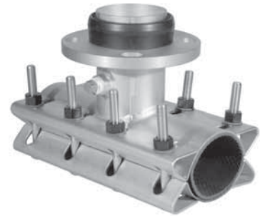
MJ Outlet shown on FTSS Tapping Sleeve