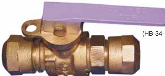
(HB-34-RW handle shown)

For easy identification, ball valves for reclaimed water have an enlarged tee-head with "RECLAIMED WATER" embossed on the brass tee-head. The reclaimed water tee-head is available on ball valves having a meter nut, yoke nut or any service line connection in sizes 3/4" -2". All reclaimed water ball valves are sold only with a padlock wing. Refer to Ford catalog section E and G for ball valve options.