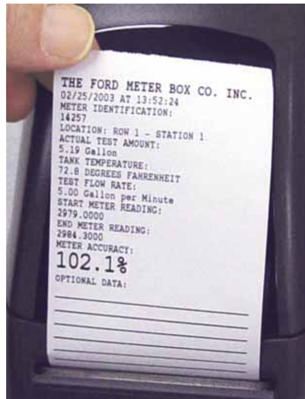
PRINTED REPORT FROM AMS