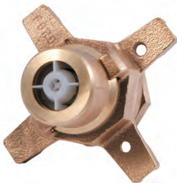
Expansion Connection with Check Valves