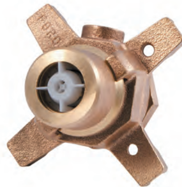
Locking Expansion Connection with Check Valves