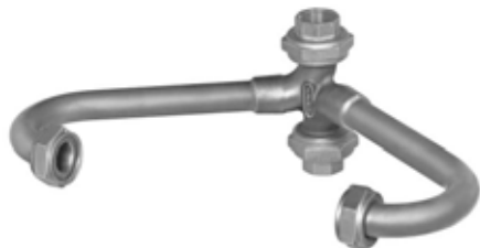
No. 4 Copperhorn with 1" Female Iron Pipe inlet and outlet