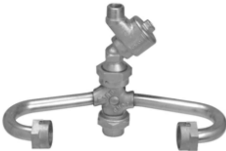
No. 2 Copperhorn with optional HHSCH8-333 3/4" Straight Accessible Dual Check Valve