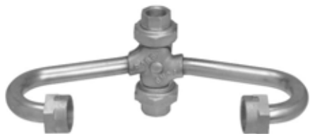
No. 3 Copperhorn with 3/4" Female Iron Pipe inlet and outlet