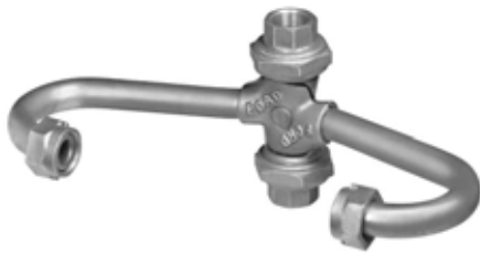
No. 1 Copperhorn with 3/4" Female Iron Pipe inlet and outlet