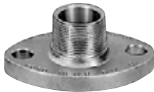
Male Iron Pipe